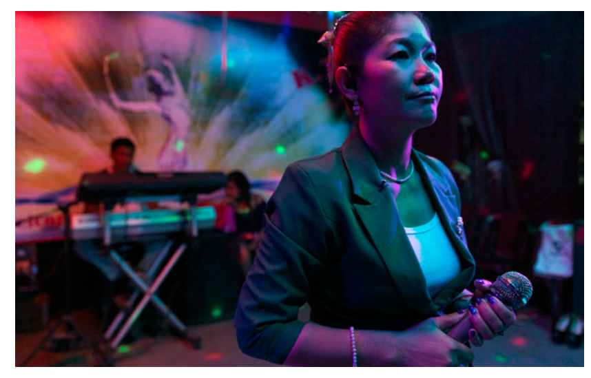
As well as being an entertainment worker, this woman is a peer outreach worker, sharing information on HIV prevention and treatment with other entertainment workers in Phnom Penh, Cambodia.

UNAIDS and the World Health Organization (WHO) have developed a joint advocacy brief that presents scientific evidence on the links between HIV, the human papillomavirus (HPV) and cervical cancer. UNAIDS also supports advocacy efforts by civil society and engages with policy-makers, civil society and other partners, making the case for the urgent need to integrate HIV and cervical cancer prevention, screening and treatment services.