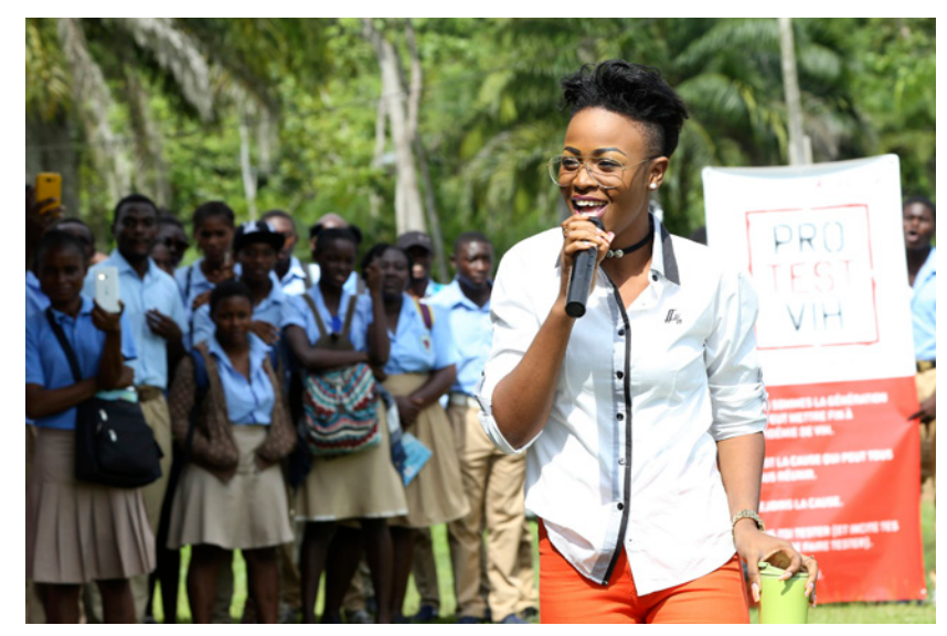
Increasing city involvement in HIV prevention—a 2017 event with Pro-Test Youth Ambassadors, in partnership with the Gabon Ministry of Health, the French Embassy in Gabon, UNAIDS and the Pan African Organisation for the Fight against AIDS.

France has contributed over US$ 6 billion to the Global Fund. UNAIDS maximizes the return on France's investment and ensures that technical support is available, with a shared focus on human rights, key populations, gender equality, health system strengthening, civil society, sexual and reproductive health and rights, and education.